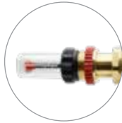
Flow meter for precise balancing 0-13GPM