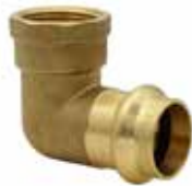
Press x FNPT Elbow

No lead/DZR forged brass ANSI/NSF 14 & 61 ASME B16.51