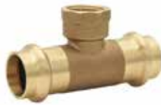
Press x FNPT Tee

No lead/DZR forged brass ANSI/NSF 14 & 61 ASME B16.51