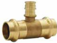
Press x Press x F1960 PEX Tee

No lead/DZR forged brass ASTM F1960 ANSI/NSF 14 & 61 ASME B16.51