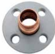
Press x Flange Adapter