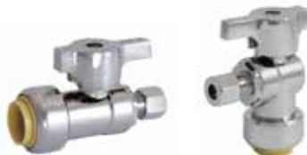
T-596NL Push x OD

No lead forged brass ANSI/NSF 61-9 125 CWP, max temp 120°