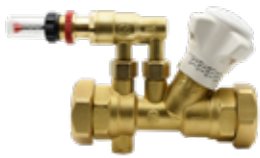
Balancing Valve (can be used with LegendConnect).