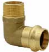
Press x MNPT Elbow

No lead/DZR forged brass ANSI/NSF 14 & 61 ASME B16.51