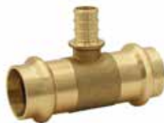
Press x Press x F1807 PEX Tee

No lead/DZR forged brass ASTM F1807 ANSI/NSF 14 & 61 ASME B16.51