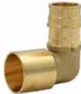
F1960 PEX x Sweat Elbow

No lead/DZR forged brass ASTM F1960 ANSI/NSF 14 & 61 ASME 16.51