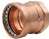
Press x FNPT Adapter