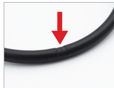
Brass Fittings & Unions